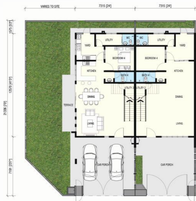
GROUND FLOOR | 底层平面图