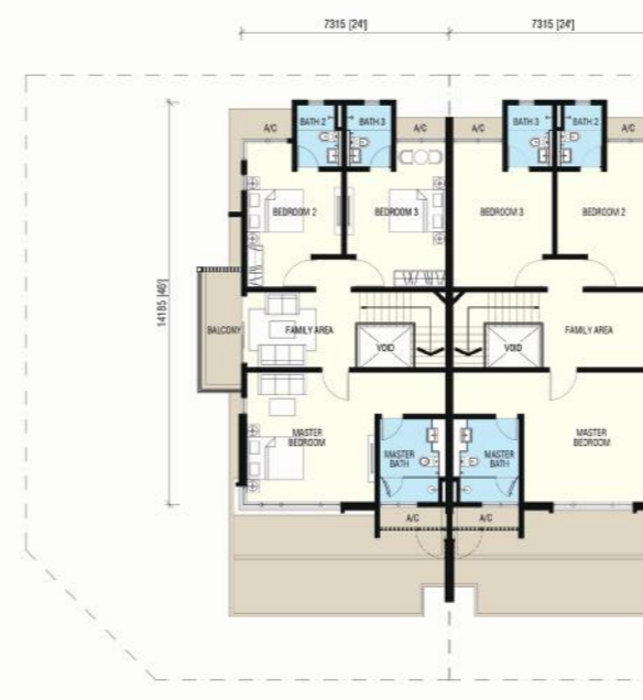
FIRST FLOOR | 一楼平面图