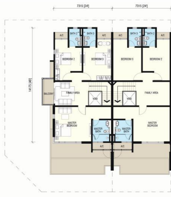
FIRST FLOOR | 一楼平面图