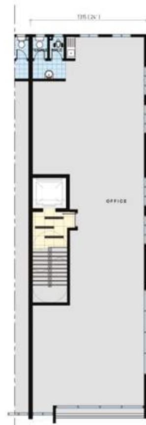
SECOND FLOOR PLAN SCALE 1 : 100