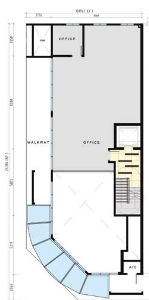
MEZZANINE FLOOR PLAN SCALE 1 : 100