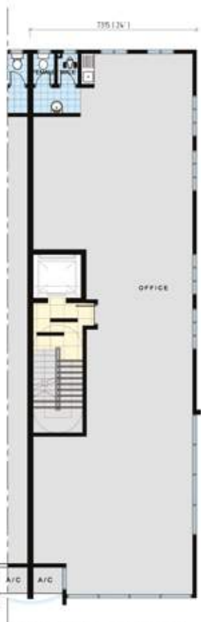
FIRST FLOOR PLAN SCALE 1 : 100

1 Intermediate land area 24' x 80' built-up area 5,699 sqf