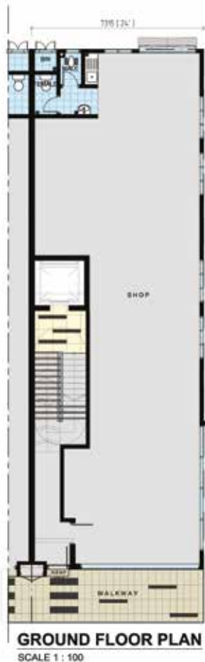
GROUND FLOOR PLAN SCALE 1 : 100